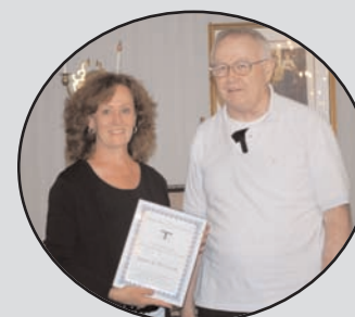
Golf Outing, page 3