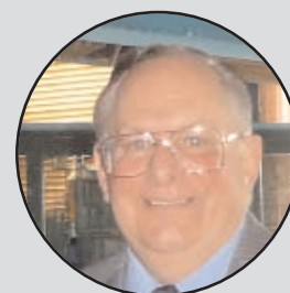
Volunteer Luncheon, page 3