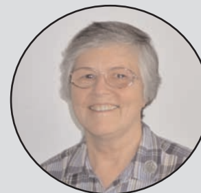
Message from the Executive Director, page 2